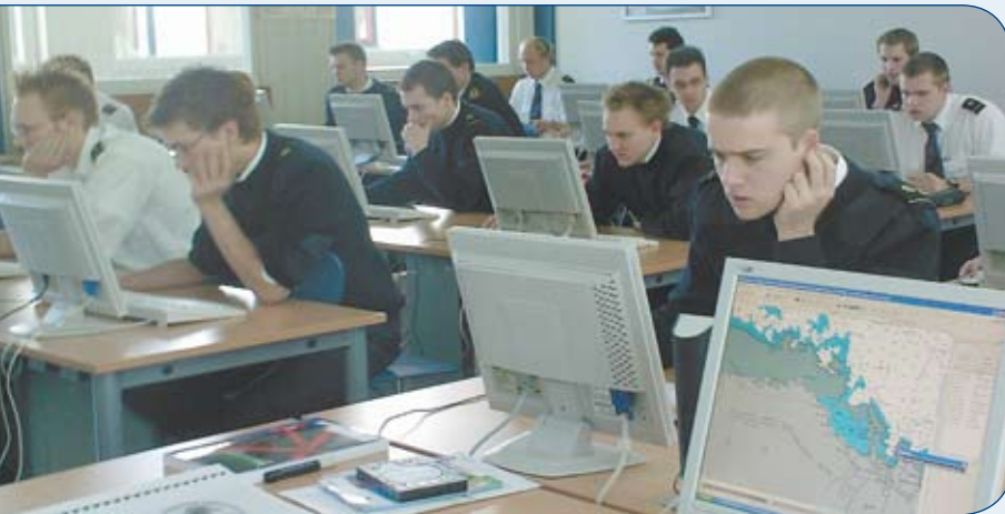
Navmaster ECDIS for Training being used at the Maritime Institute Willem Barentsz.

It consists of type approved ECDIS software which can be run on standard PCs and networks.