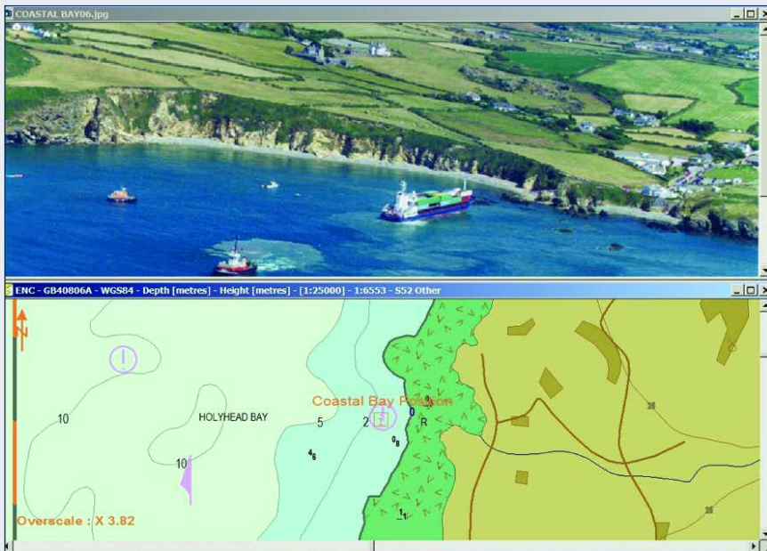
Navmaster Office displays the position of a grounded vessel on an overscaled ENC chart in the lower chart window, with an aerial photo of the same vessel in the top window.

Navmaster Office is an electronic chart system designed for managers who need to work with navigation charts. It can fully replace paper charts for incident analysis, voyage risk assessment, passage planning, survey and port assessment, emergency response, moorings management and other such tasks. The system is easy to install, it can be run on standard PCs, networks and laptops, and it gives managers a full range of chartwork tools with which to carry out a wide variety of assignments. The software operates with both vector and raster electronic charts.