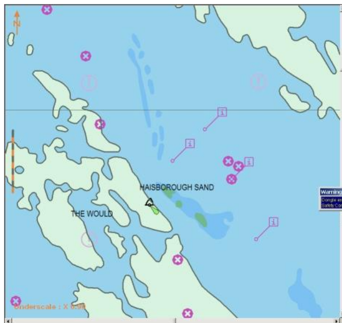
Figure 5 30m safety contour applied

With the default 30m safety contour setting Haisborough Sand does not stand out so well whereas with a 10m setting it is very clear indeed.