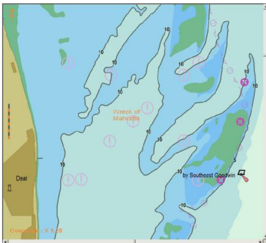
Figure 4 ENC Scale 1:90,000 no hazard information