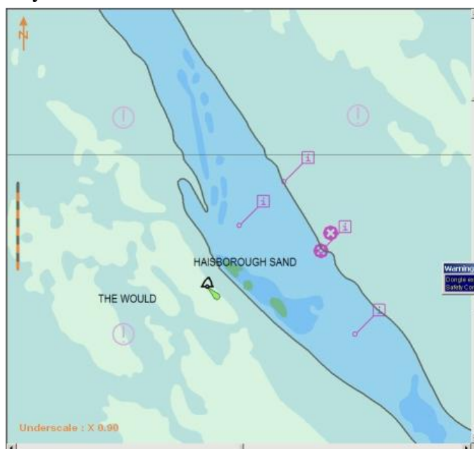
Figure 6 10m safety contour applied

With the default 30m safety contour setting Haisborough Sand does not stand out so well whereas with a 10m setting it is very clear indeed.