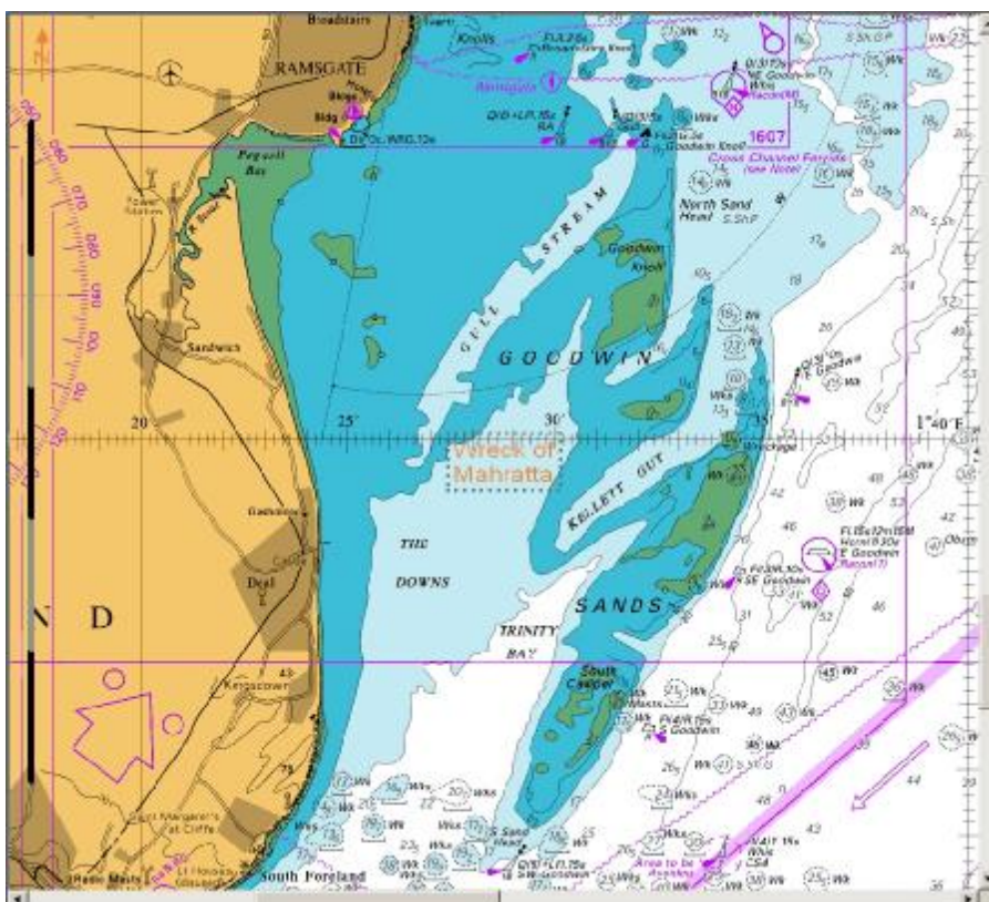
Figure 2 BA paper chart \ ARCS 1:150000 - no hazards shown