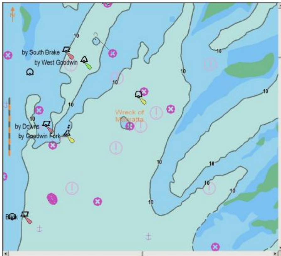
Figure 3 ENC scale 1:45000 hazards beneath safety contour shown