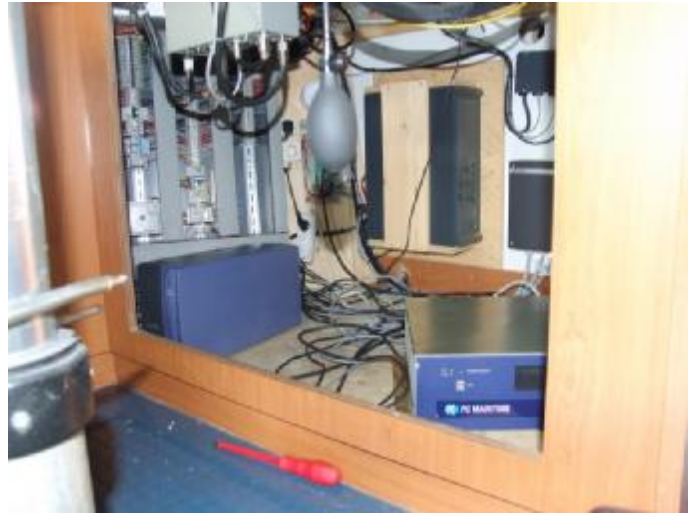
Figure 5 Boxes and wiring

more important to keep bridge instruments working correctly and shore side stations correctly informed. Navigation officers need relevant systems knowledge so that they can undertake basic troubleshooting and keep the systems that are being relied on so widely running smoothly - another training need that should not be overlooked.