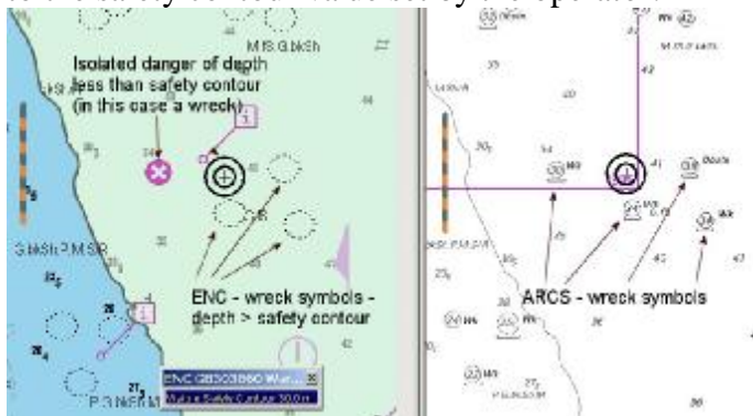
Figure 1 An example of the use of the Isolated Danger symbol on an ENC

Here's why. We had a vessel trialling Navmaster ECDIS with ENC and ARCS charts. They came to anchor off Teesport on the east coast of England. The ARCS chart to the right shows four wrecks in the vicinity of the vessel's position. The ENC to the left shows three wreck symbols; but the wreck to the west of the vessel is depicted by an Isolated Danger symbol because its depth at 30m is less than or equal to the safety contour value set by the operator.