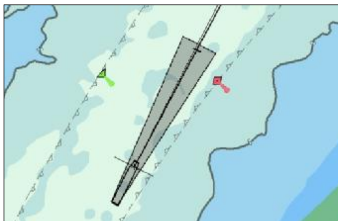
Figure 3 Guard zone set at 1 minute and 5 x beam

In Navmaster ECDIS we have added an additional parameter so that the operator can define the width of the "searchlight" that looks for safety contours and warning areas. For the river example, this can be set very narrow (down to 1 x beam) and in mid-ocean quite wide (10 x beam at its farthest limit). And the searchlight area can be displayed so the operator can see what, if anything, is triggering an alarm or indication.